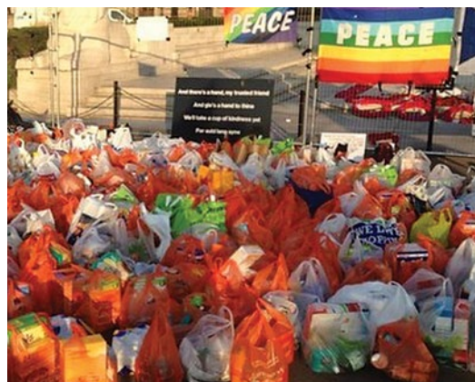
Mass donations to an impromptu food bank, George Square, Glasgow, 21 September 2014.

This is hardly a revolutionary idea. The Callaghan government signed up to the UN Convention on Economic, Social and Cultural Rights in 1976. We want to see this convention brought into Scots law.