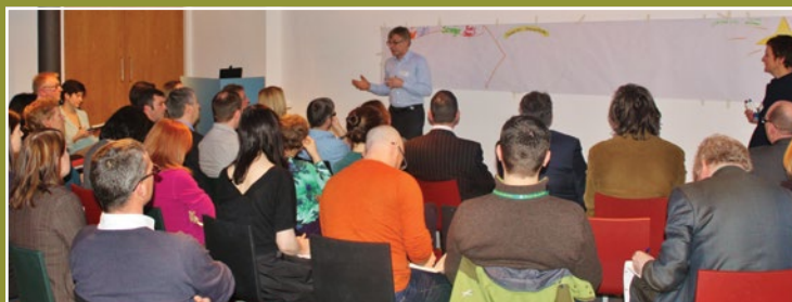
Glasgow Sustainable Food Cities Workshop

We have also been working with a range of partners in both Edinburgh and Glasgow to support them in their efforts to become Sustainable Food Cities. This work is on-going.