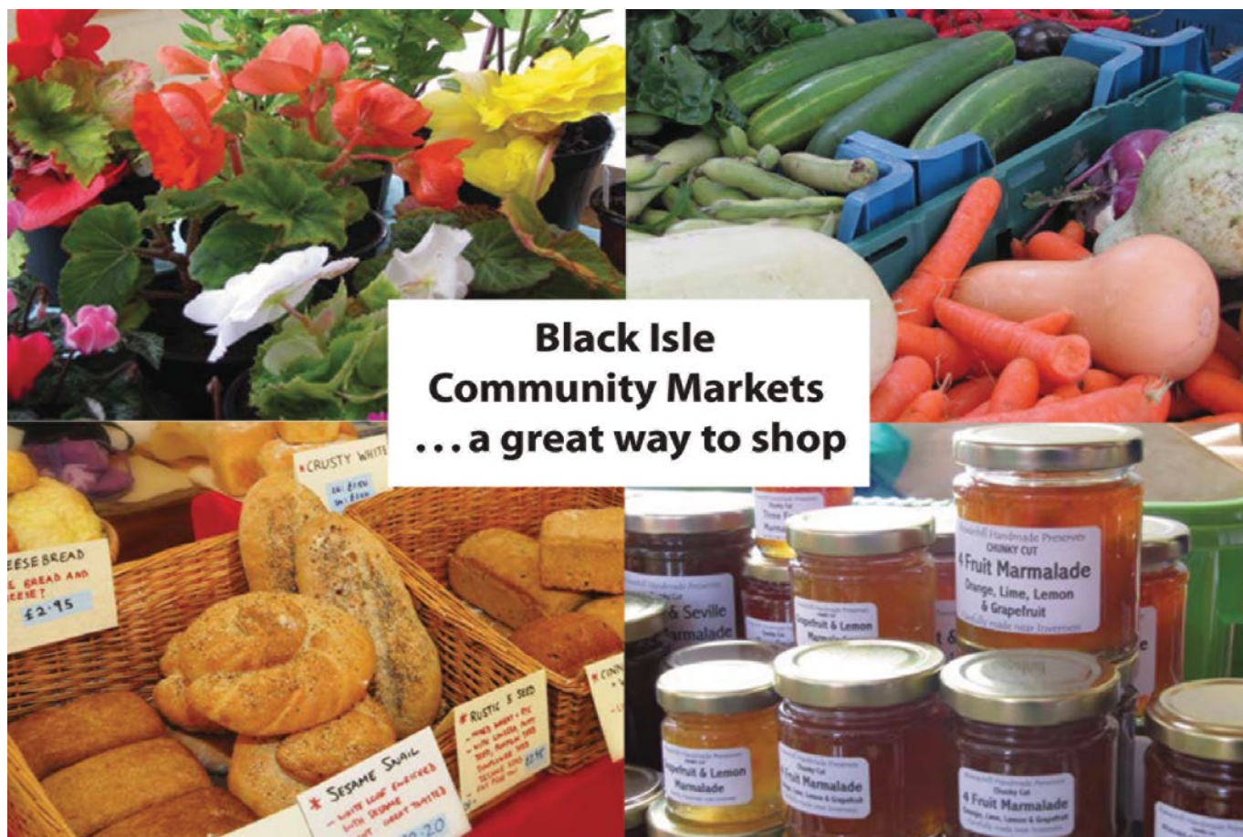
Black Isle Community Markets ...a great way to shop